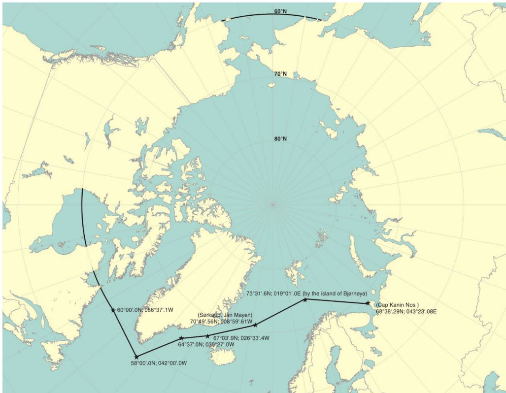
Figure 2 – Maximum extent of Arctic waters application