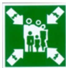
Fig. 5.3.3(2) Passenger gathering station