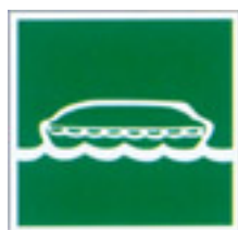
Fig. 5.3.3(1) Crew boat station

5.3.4 The bottom of the pattern should be in green with white graph, and the color and plan scale should meet the requirement of IMO A.760(18) and MSC. 82(70) resolutions.