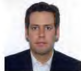
Photograph of the holder of the certificate

Signature of the holder of the certificate