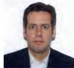
Photograph of the holder of the certificate

Signature of the holder of the certificate