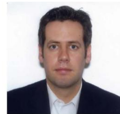
Photograph of the holder of the certificate